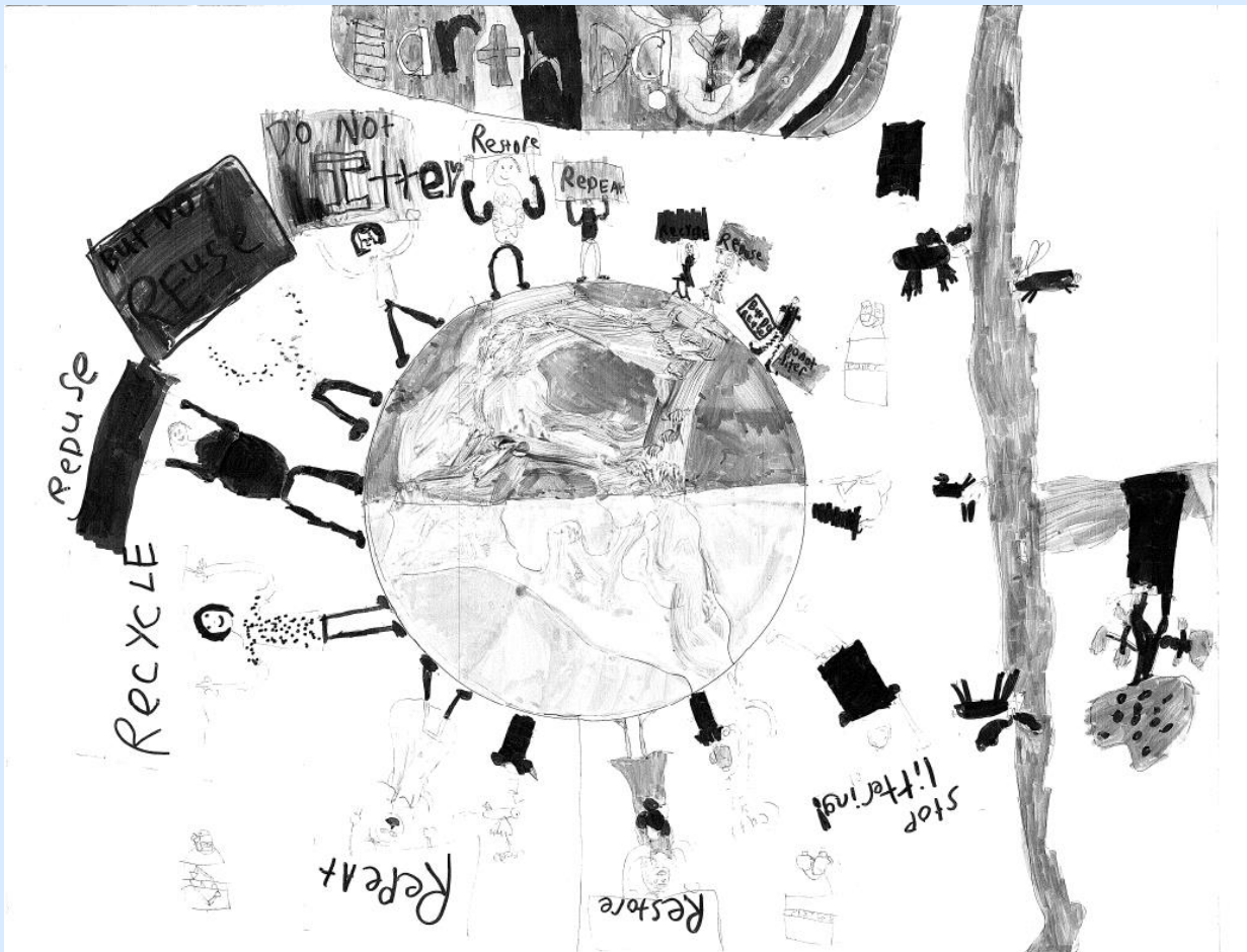
*Poster Submitted by Angelica, 3 rd Grade, Lafayette Elementary School